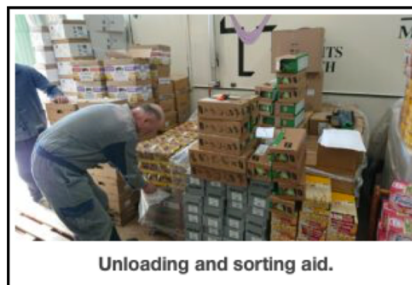
Unloading and sorting aid.